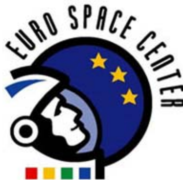
The Euro Space Centre logo