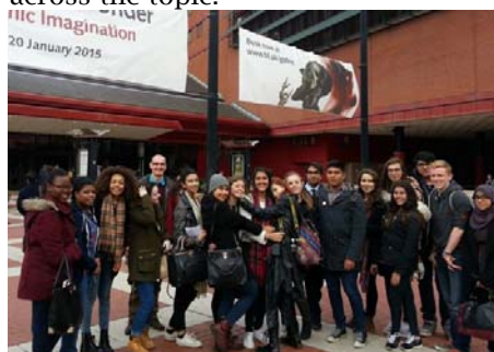
Tension building outside of the Gothic Exhibition