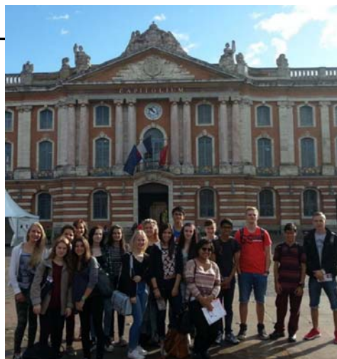
French Exchange students exploring Toulouse

It means that our school has been officially recognized as a national centre for teaching and learning Chinese and will receive annual funding, resources and support from Chinese Hanban to enable us carry out more outreach work to promote Chinese learning and Chinese culture locally. Having Confucius classroom status also offers more opportunities for us to work closely with some prestigious HE institutes such as the IOE and Warwick University and to establish firm partnership with Chinese partner schools.