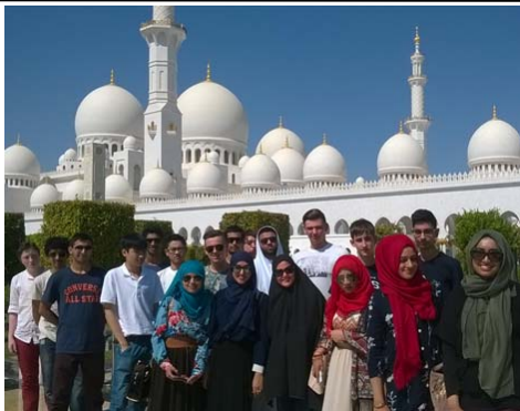
The students at one of the large mosques

Adam Anwar writes: On 24th October a group of students visited Dubai in order to take part in an Arabic language course and to gain an insight into the culture of the Emirate. The visit included a trip to Burj Khalifa, the tallest building in the world, Palm Jumeirah, day trips to the Arabian desert and Abu Dhabi, and a visit to the Dubai museum. The difference between new Dubai and old Dubai fascinated me along with how the modern investment contradicted the traditional roots of the United Arab Emirates. The most amazing fact was that 80% of the population is from nations from all across the world. It was therefore great to see so many cultures convening in one place and living in harmony. Thanks to Mrs Sharp for organising the trip and Mr Elsdon for accompanying the group.