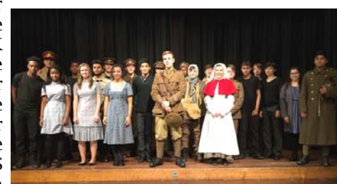
The cast pose for their production 'Goodbye'