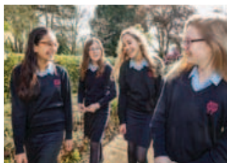
WOLVERHAMPTON GIRLS' HIGH SCHOOL

Intensive coaching or tuition for the tests is not in the long-term interests of your child. The Consortium of Grammar Schools in Shropshire, Walsall and Wolverhampton is in no way connected to, nor does it endorse or recommend, the services of any organisation or agency purporting to offer tuition and/or training or revision courses for children to assist in preparing them for school entrance tests. Many children are anxious about sitting tests. You can help by not putting pressure on your child.