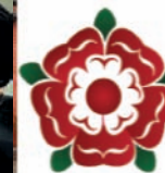
QUEEN MARY'S HIGH SCHOOL