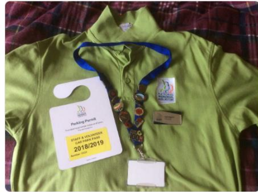
11:03 PM - 1 Jun 2019