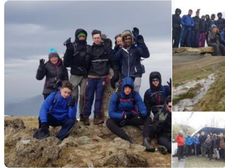
2 3 15

QMGs CCF @QMGS CCF · Apr 15 Day3 for @qmgs1554 CCF Cadets on #farchynys Venturer. The intended 3x3000ft peaks of Snowdon were unobtainable fully. Strong cold winds prevented a traverse of Crib Goch, Yr Wyddfa and Carnedd Ugallin were ticked off. Descent via the Snowdon Ranger path was the #safeoption Da iawn.