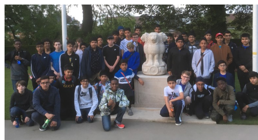
Indian Forces memorial, Menin Gate, Ypres. It is dedicated to the 130,000 troops of the Indian Forces who served in Flanders during the Great War of 1914-1918