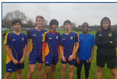
Year 11 cross country team came 2nd in the team competition in Walsall schools event.