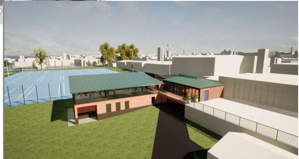
Pavilion and viewing gallery