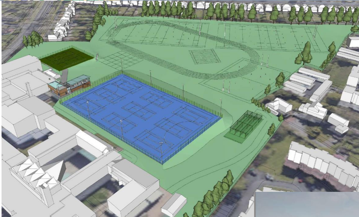
Initial project plans

Academic in purpose - Generous in approach - Enterprising in spirit - International in outlook