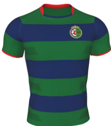
QMGS 1 st XV Kit Sample