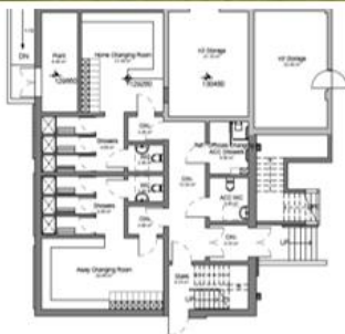
Proposed Lower Ground Floor Plan (NTS)

A Walsall school is looking to transform its sporting facilities to enable it to compete competitively in hockey through an ambitious plan.