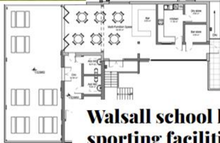
Proposed Upper Ground Floor Plan (P)