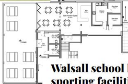
Proposed Upper Ground Floor Plan (N)