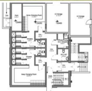
Proposed Lower Ground Floor Plan (NTS)